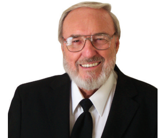
Yisrayl Hawkins THE HOUSE OF YAHWEH

To get green food for his beasts and later for